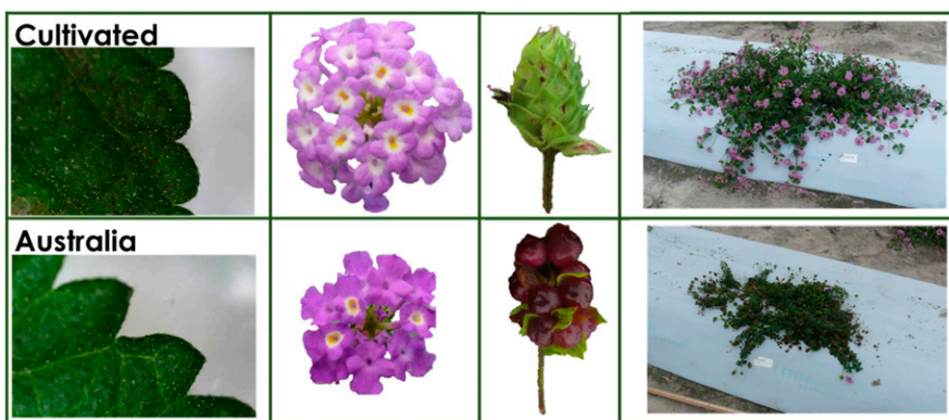
Fig. 1. Representative comparison of U.S. cultivated (top) and Australian naturalized (bottom) trailing lantana. Note differences among leaf serrations, flower number, fruiting and form. Field picture taken 20 weeks after planting.

Luscious® grape trailing lantana ( L. montevidensis 'Robpwpur') and it has since received prestigious awards as a top performer from plant trials at Kansas State University, University of Georgia, Texas A&M University, Longwood Gardens, North Carolina