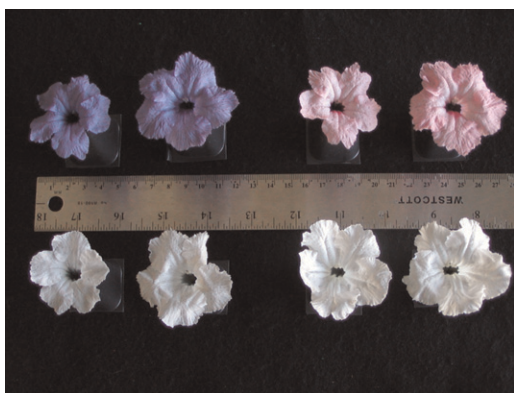
Fig. 2. Flower size and color of diploid (left) and tetraploid (right) Ruellia purple, pink, white, and white with purple corolla tube (clockwise from top left).

Field performance. All three sites had similar weather patterns and did not deviate significantly from the 10-year average, except for total rainfall at Fort Pierce, which was high during the months of August to October. There were highly significant differences ( P < 0.0001 ) for landscape performance, flowering, and fruiting for weeks, sites, plants, and all of the interactions, whereas the differences between blocks were not significant (data not shown). Average landscape performance for all plants was 3.3 at northwestern, 3.5 for north-central, and 3.6 for southeastern Florida (Table 4). This may be the result of different environmental conditions, a longer establishment period needed as a result of initial cooler temperatures, and a more rapid plant decline in the northernmost site as evidenced by the lower ratings from Weeks 16 to 24 (data not shown). Averaging over the three sites, the highest landscape performance rating was on Week 8 (4.0) followed by Week 12 (3.8) and Week 16 (3.5).